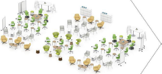
HYBRID Session Room #4