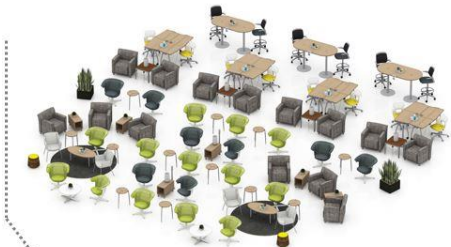
HYBRID Session Room #2