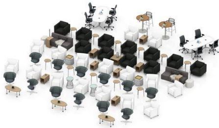
HYBRID Session Room #1